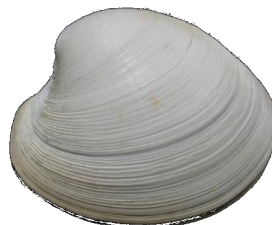
Clam ( mercinaria )