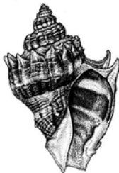
Florida Kings Crown Conch