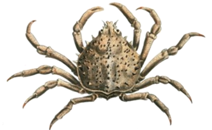
Decorator Spider Crab