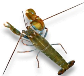
Big Claw Pistol Shrimp