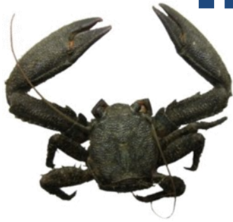
Green Porcelain Crab