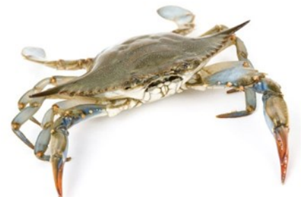
Atlantic Blue Crab