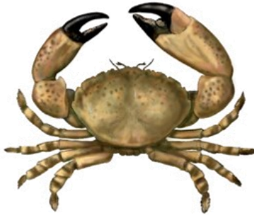
Atlantic Stone Crab